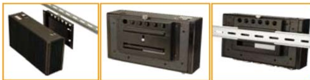
Adjustable to fit with different rail width