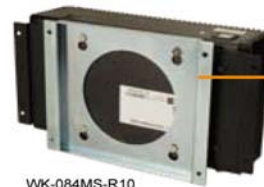
VESA 100 wall mount kit